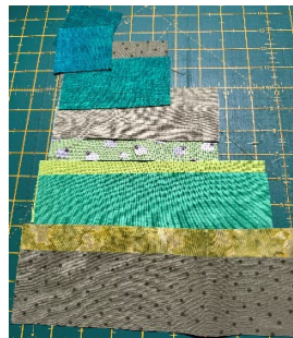
Tones of colour