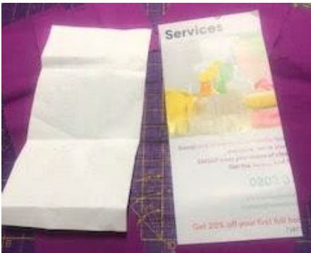
Till receipt -Left Junk mail-right

2 long strips length 9" 11" or 13" - ½" bigger than you finished block. (8.5", 10.5" or 12.5")